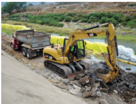
Removing concrete debris in stream bed