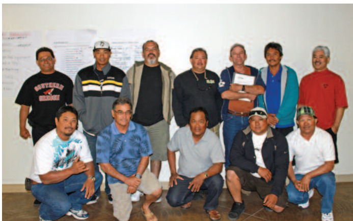
Koga Foremen complete a management training session