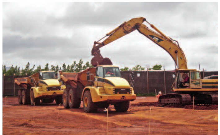
Kaua'i Algae Farm