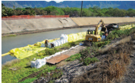
Installation of BMP barrier

One of our first challenges was our encounter with the Hawaiian stilt bird. The work area was within a nesting site for the endangered stilt that inhabits the tidally influenced brackish water. Work had to be completed between the months of September 2010 and March 2011 before the nesting season began.