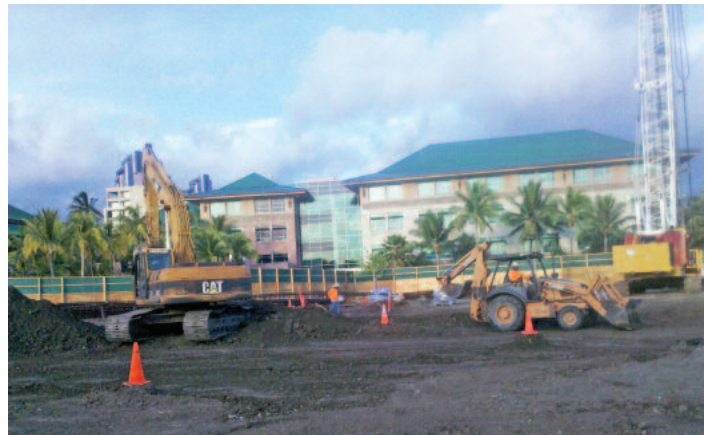
UH Cancer Center