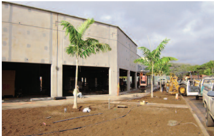
Moanalua Shopping Center – completed building foundation and landscape grading