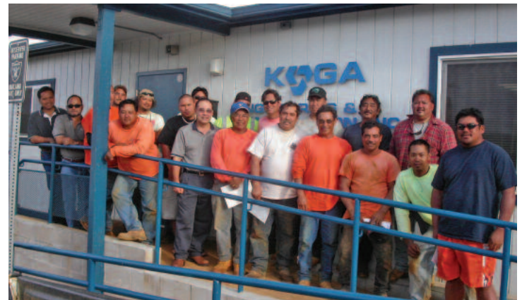
The Kaua'i Gang