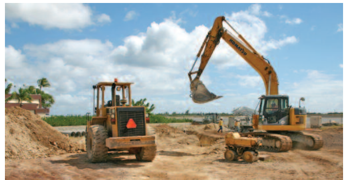
Installing new 18" drain line