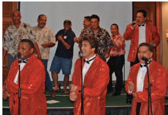
Having fun with A Touch of Gold