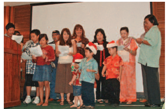
The singing contest winners - Koga Yard Team