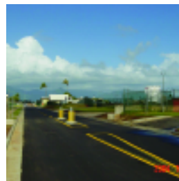
Widen 3rd Street at Kaneohe Marine Base Headquarters with Thurston Pacific.