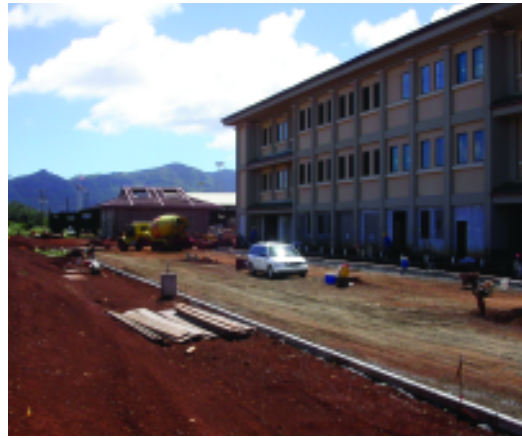
Kauai Judiciary Complex with Unlimited Construction.