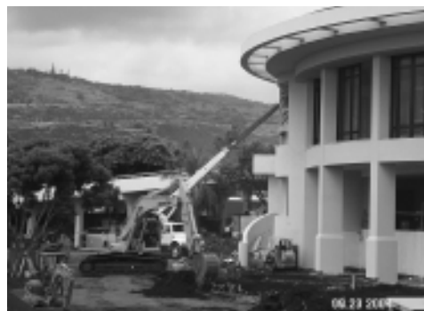
11th hour at Sheraton Keauhou.