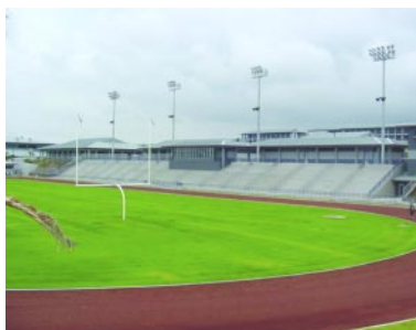
Kealakehe High School Increment 4 Phase II with Dick Pacific Construction.

Until next time, work safe and remember, there's always a better way.