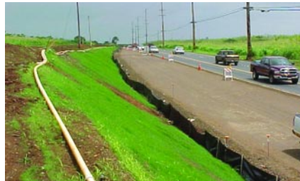
Slopes grassed and traffic lane prepared for a.c. pavement at South Leho Drive.